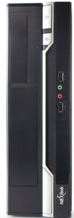
Small Form Factor