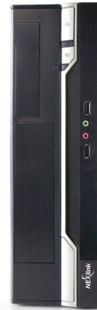
Small Form Factor